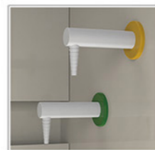
Water & Gas Tap