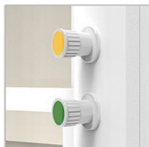
Water & Gas Remote Control Valve